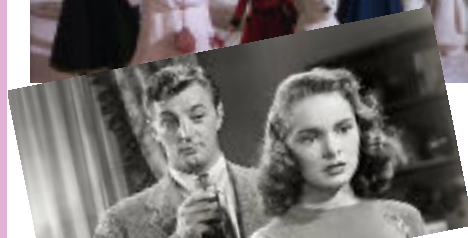
It's a wonderful life